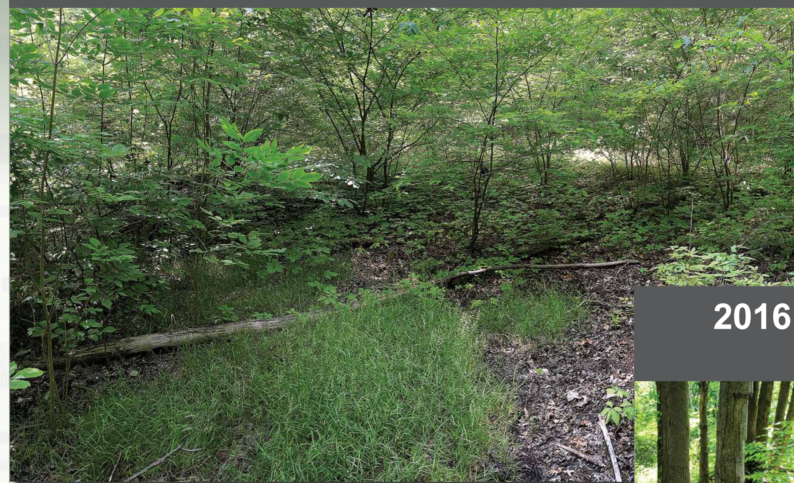
2016 - West side of Area of Concern 1 looking east