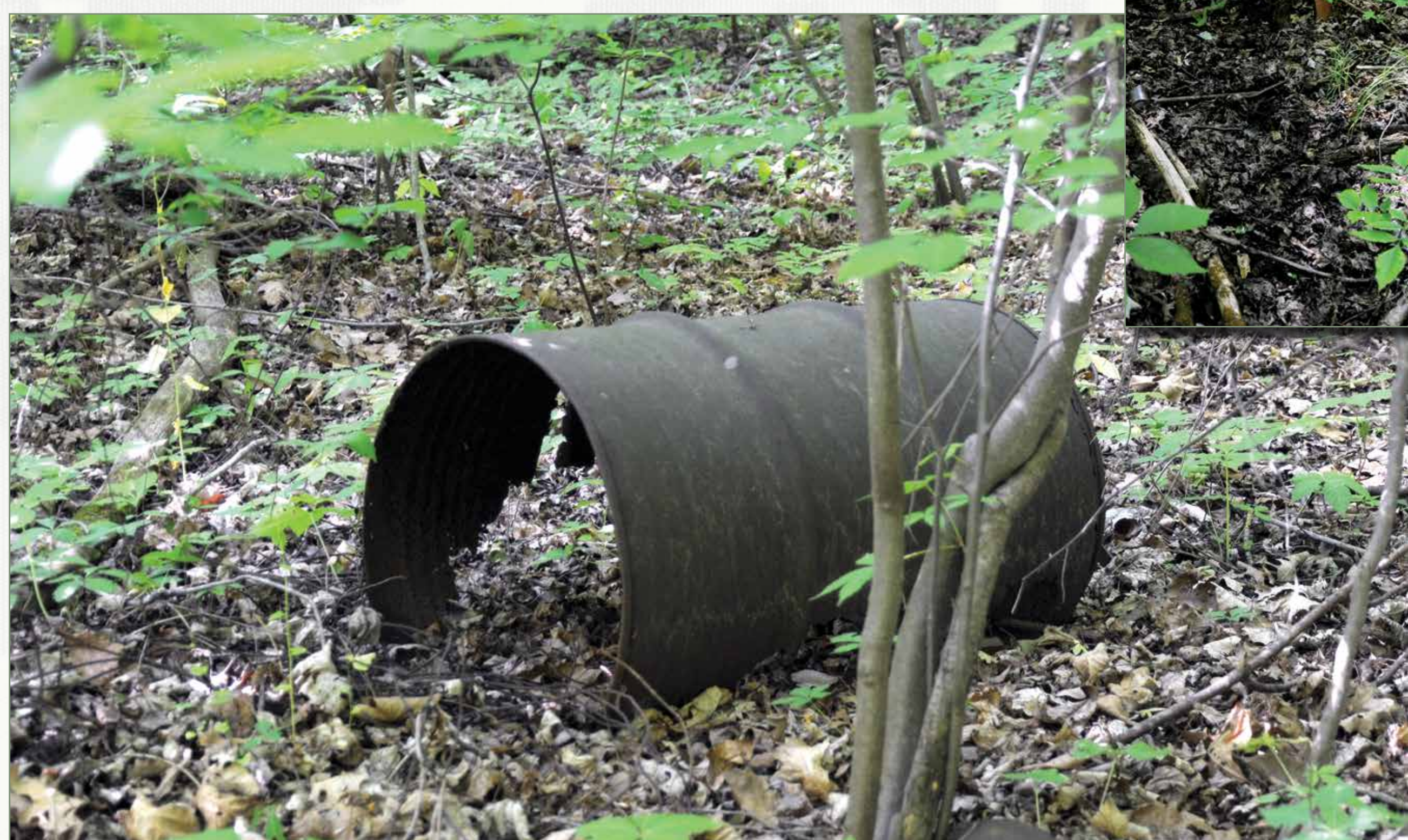
2016 - Drum carcass in Area of Concern 1