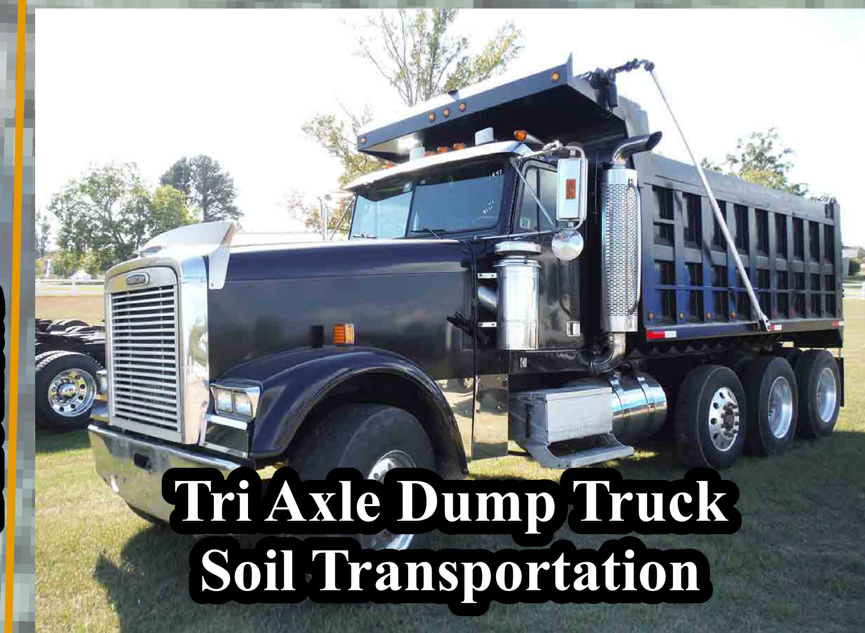
Tri Axle Dump Truck Soil Transportation