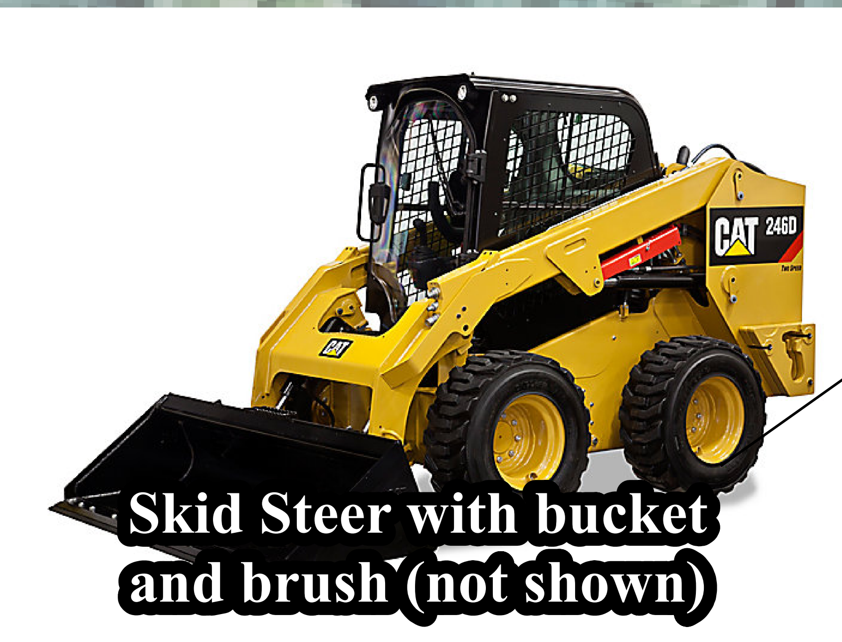
Skid Steer with bucket and brush (not shown)

NOTES: ACTUAL EQUIPMENT MAY VARY. AERIAL ANOMALY DATA PROVIDED BY THE TOPOGRAPHIC ENGINEERING CENTER (TEC) AND THE U.S. ARMY GEOSPATIAL CENTER. MAP PROJECTION IS NEW YORK STATE PLANE NAD83 FEET. PARCEL IDENTIFICATION AND BOUNDARY DATA PROVIDED BY NIAGARA COUNTY TAX PARCEL IDENTIFICATION DATABASE (2010). AERIAL IMAGE FROM U.S. GEOLOGICAL SURVEY, 2008.