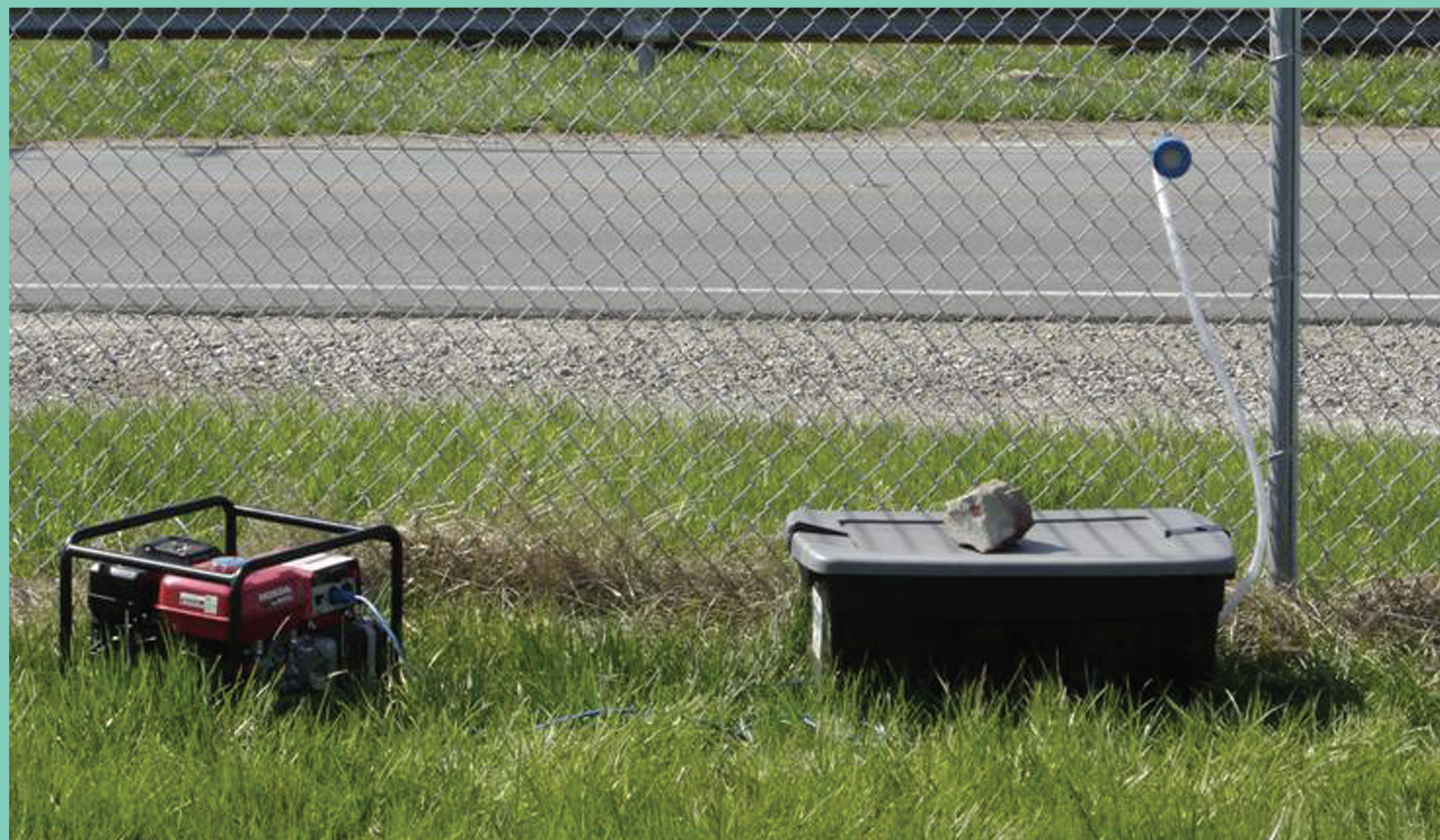
Air monitoring stations are located around the perimeter of the site and around each excavation area.