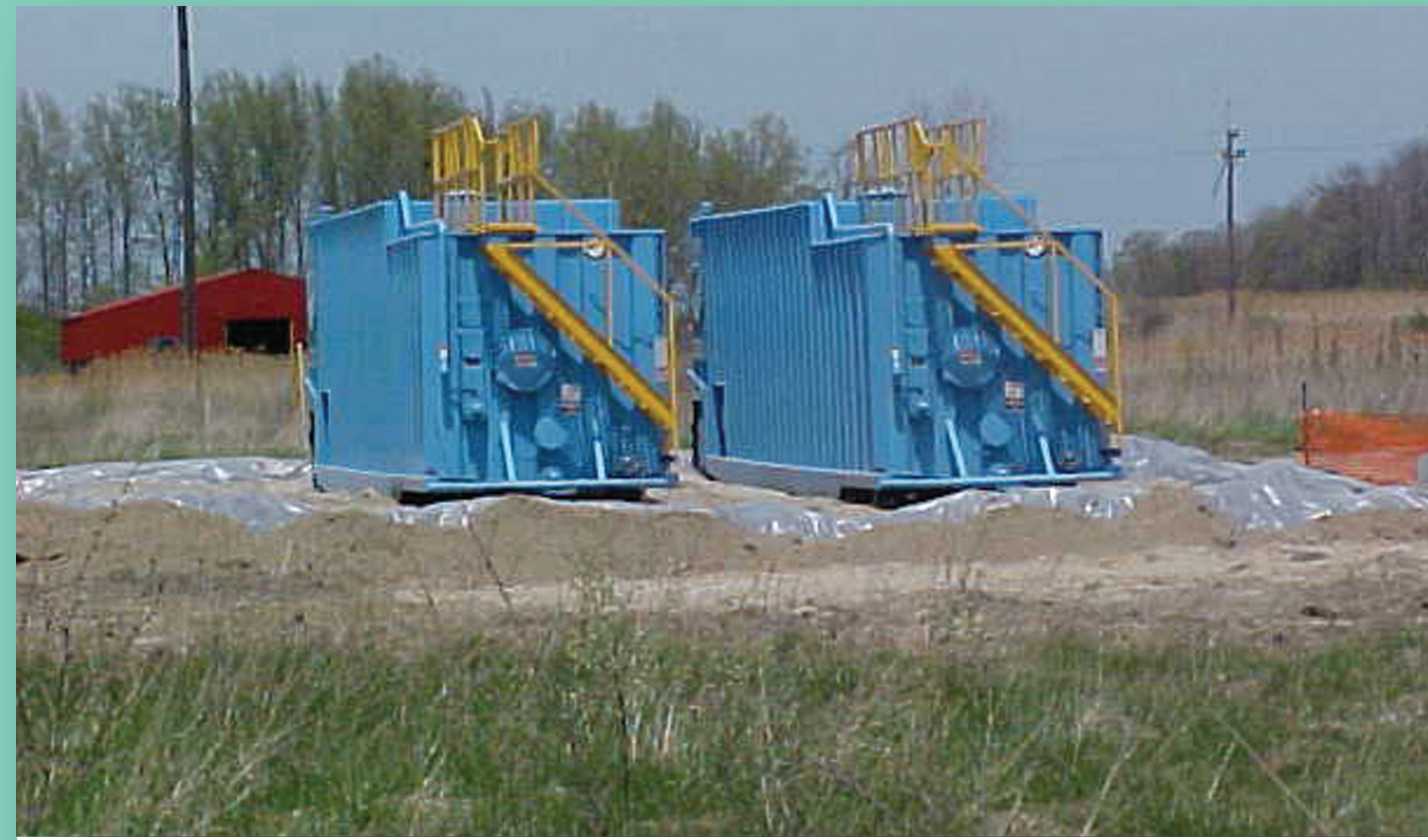
Any water that enters an open excavation will be collected, treated and properly discharged.