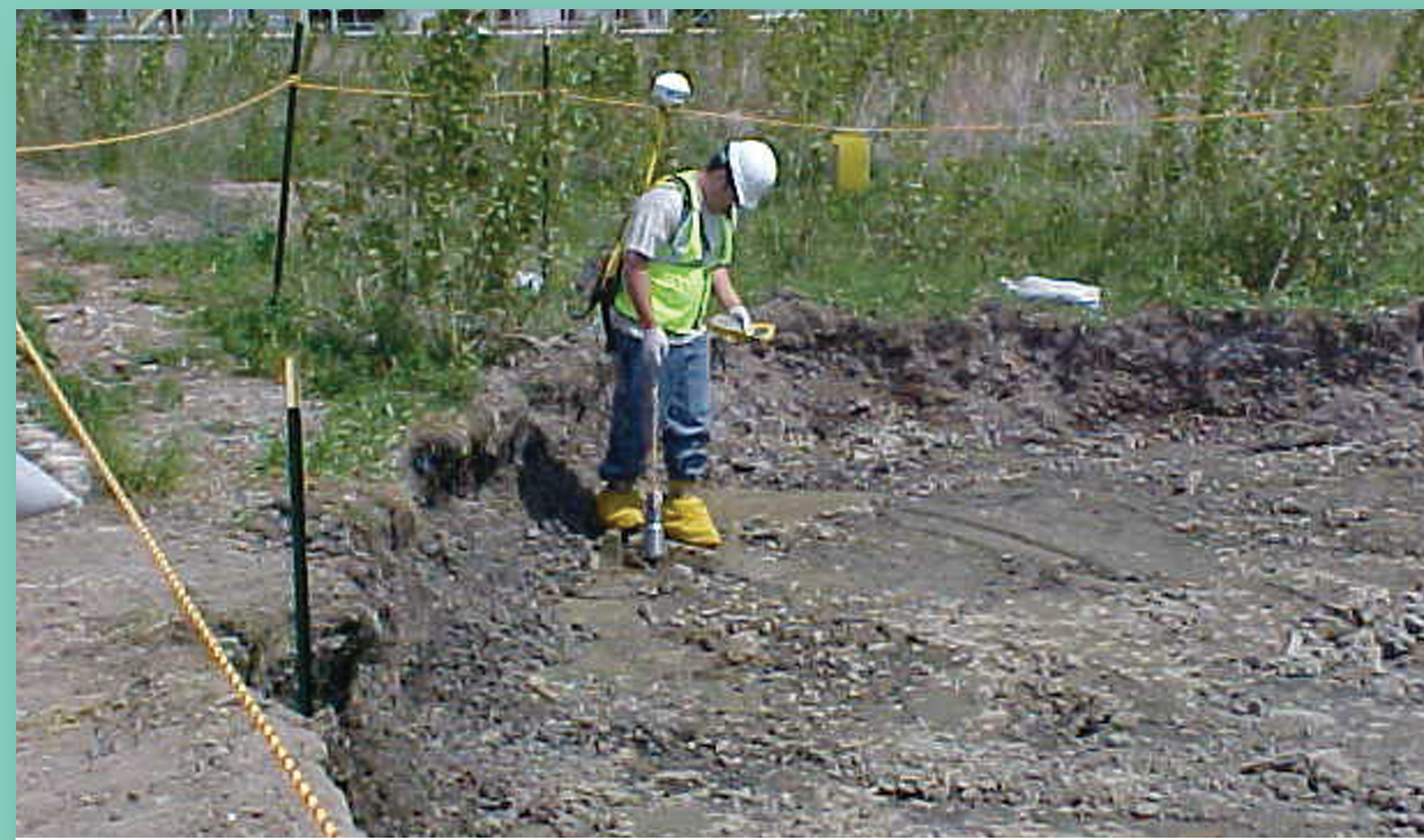
After excavation is completed, a gamma radiation scan is conducted and soil samples are collected to ensure all soil above the cleanup goals has been removed.