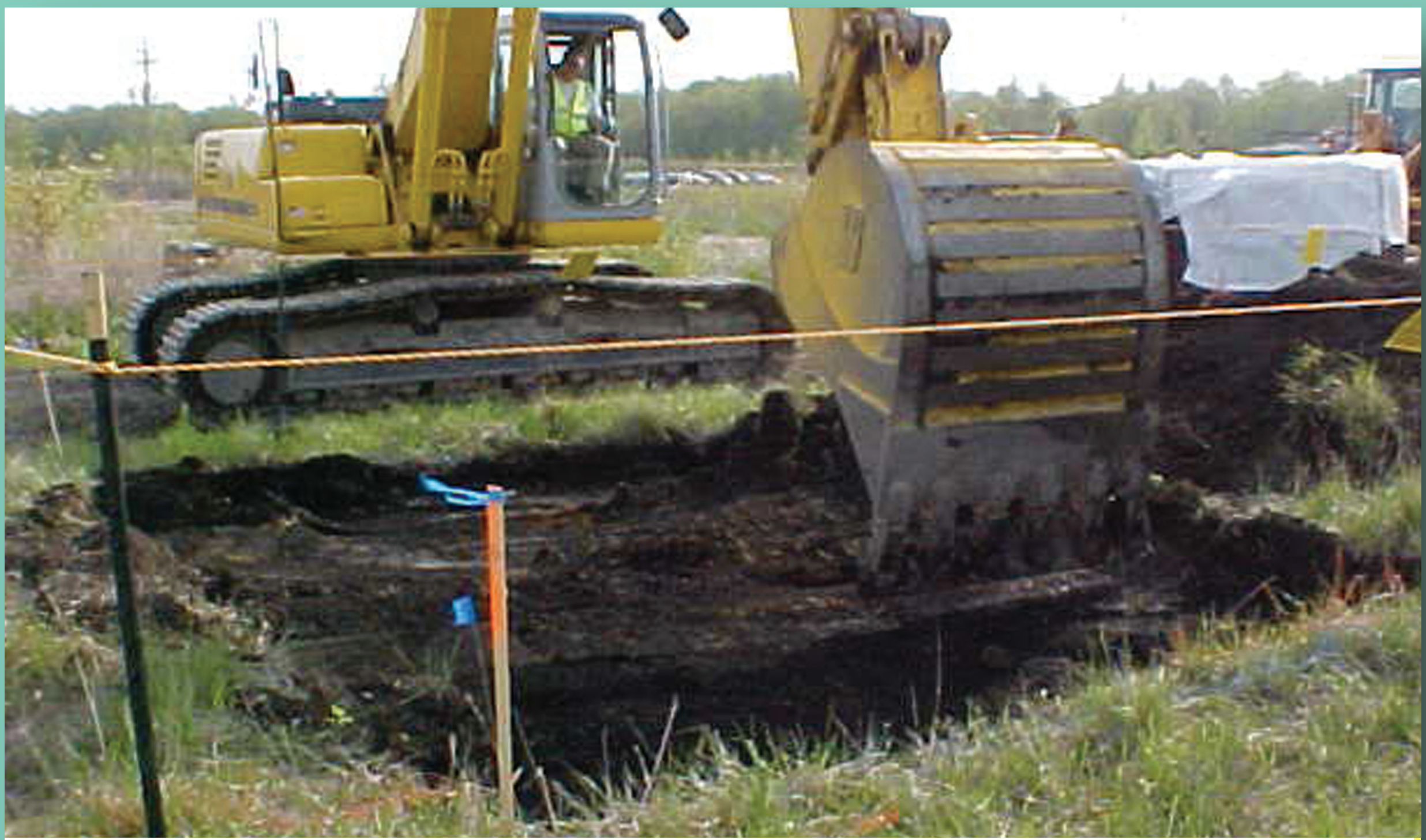
Contaminated soil above the cleanup levels in the Painesville Site Record of Decision is excavated from the site.