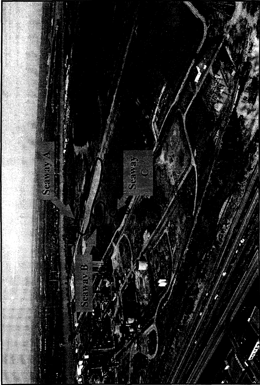
3.1a Seaway Site Areas A, B, and C