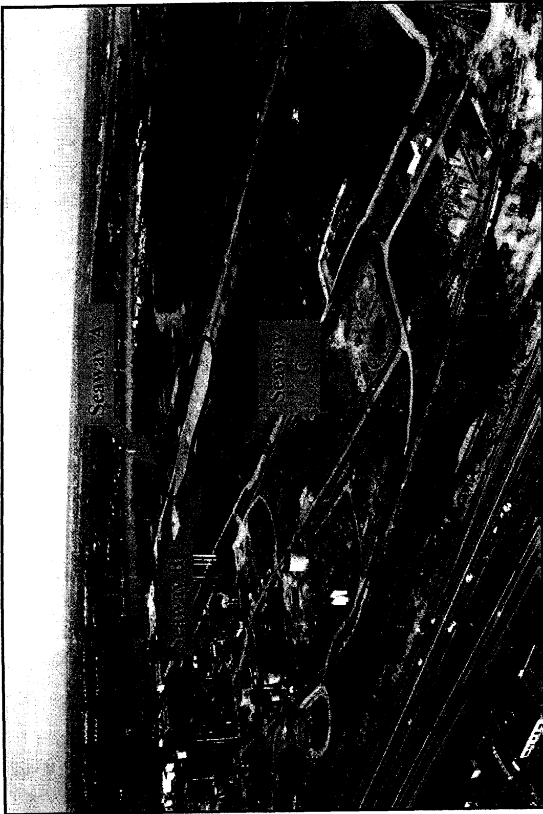
3.1a Seaway Site Areas A, B, and C