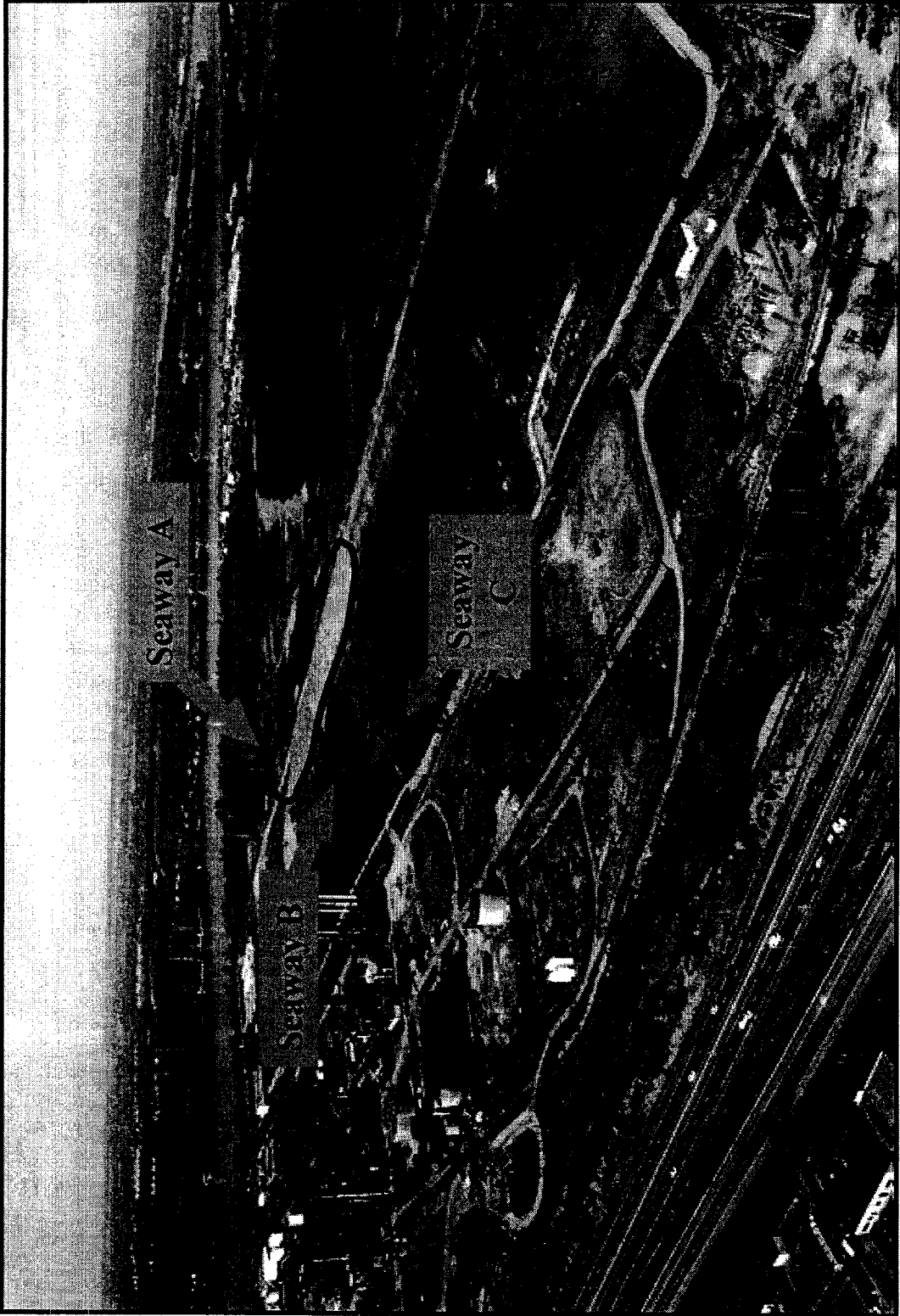
3.1a Seaway Site Areas A, B, and C