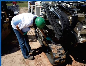
Demobilization and decontamination of equipment