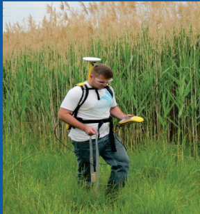
Gamma Walkover Surveys

Surveys and mapping ensures that no contaminants are left on the surface after demobilization.