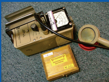
Scanning for radiation