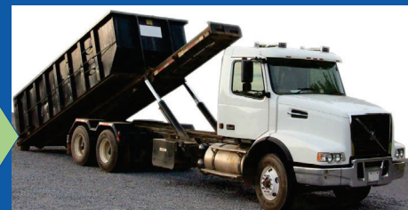
Intermodal transport truck

ISOCS measures radiological contaminants in the closed container for disposal and transportation purposes.