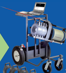
In-Situ Object Counting System (ISOCS)

ISOCS measures radiological contaminants in the closed container for disposal and transportation purposes.