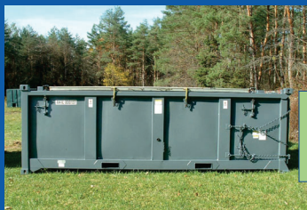
Intermodal Container Material storage for transportation