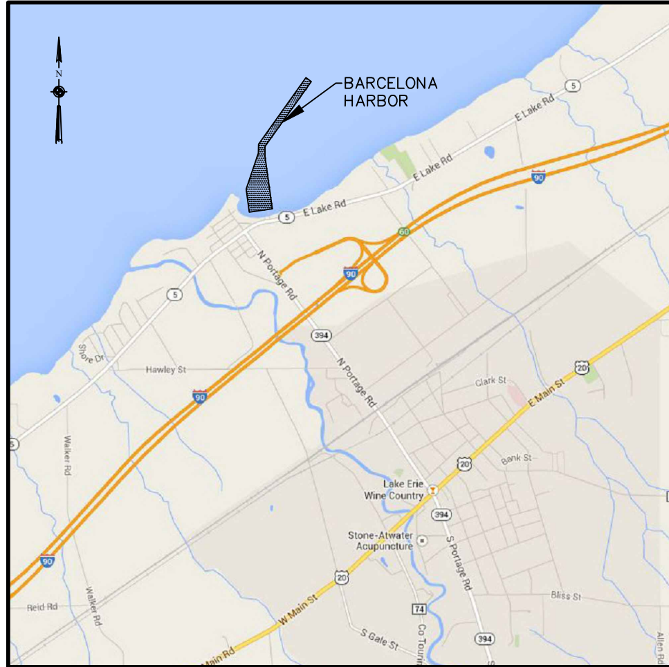
VICINITY MAP "NOT TO SCALE"