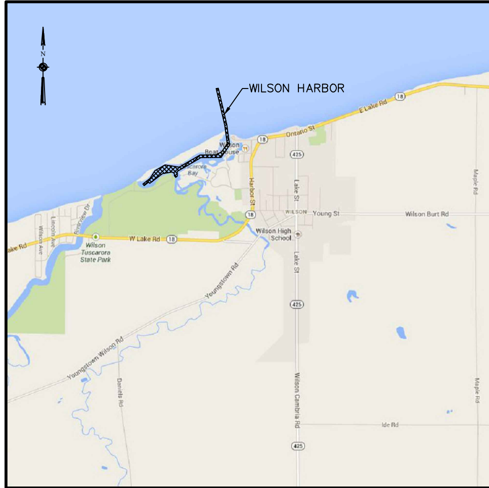
VICINITY MAP "NOT TO SCALE"