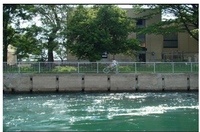
Figure 2: A section of the damaged seawall at Broderick Park. The Buffalo Sewer Authority Sewer Plant is in the background.