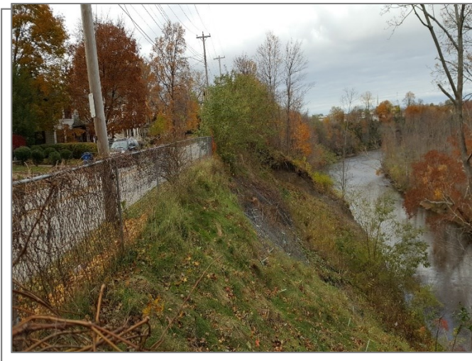
Photo (R): Project location along Grand River in Painesville, Ohio

Photo (L): Side view of slope encroachment threatening Bank Street and utilities.