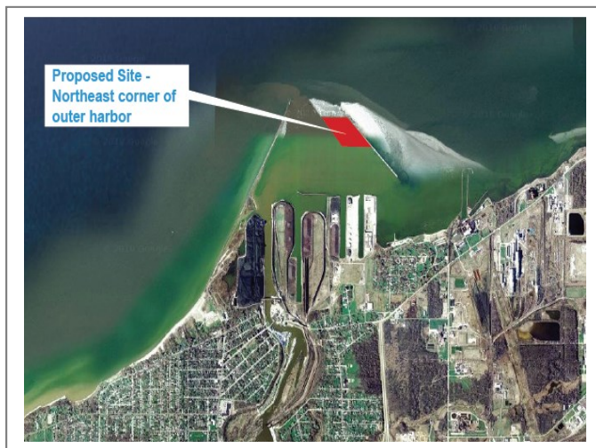
Figure 1: Map showing location of project.