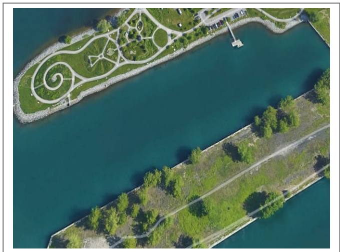
Figure 2: Aerial view of the project area south of Wilkeson Pointe.