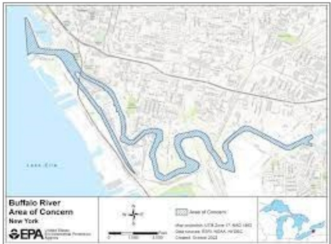
Buffalo River Area of Concern, New York