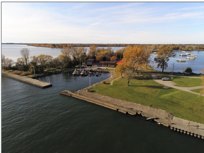
Erie North Pier as of October 2022

Erie North Pier extends from the US Coast Guard Station Erie to the east at the southern boundary of Presque Isle State Park.