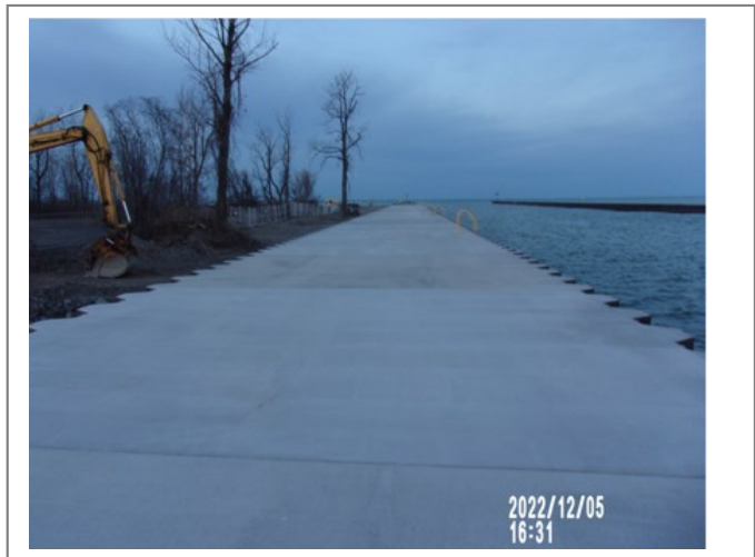
5 December 2022