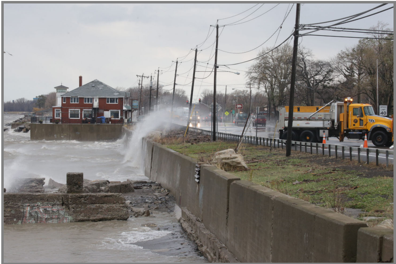
Athol Springs, NY – Current conditions; Existing Seawall looking north from water edge