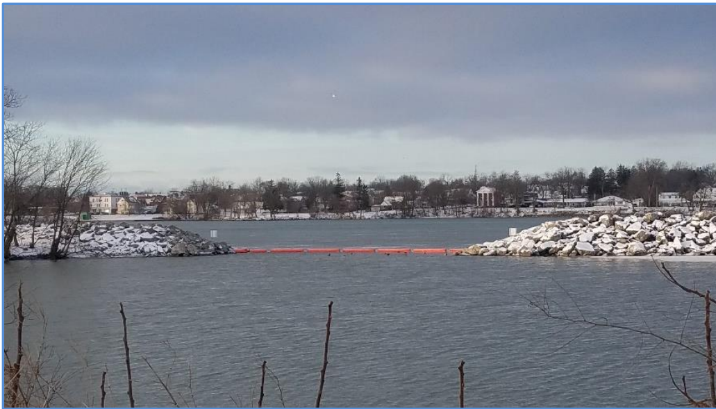
New Constructed Weir