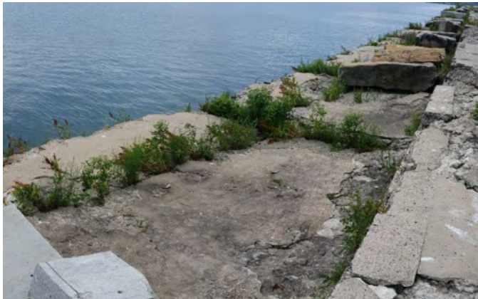
Figure 2. Current Conditions.