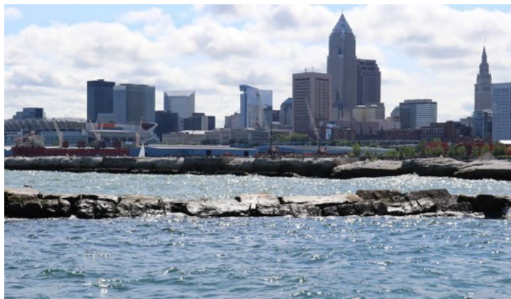
Figure 3. Current Conditions (Water Level View).