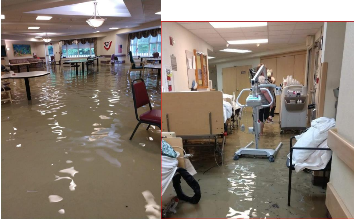
Photos show flooded dining room of nursing home and hoist which was used to transport patients to another facility